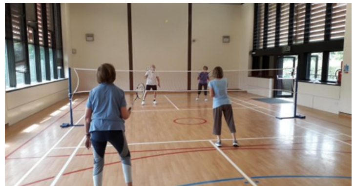
Why not give it a try? All are welcome.