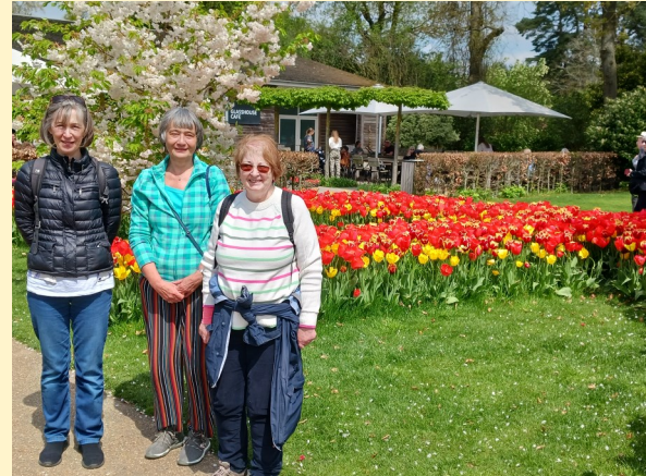
Wisley Tulip Festival