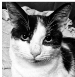
The 'Little Man' Dawn Passant