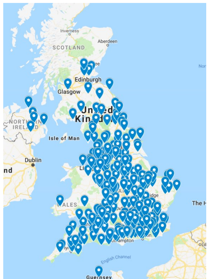
Live Beacon U3As shown in Google Maps

If you're not yet on Beacon, then contact the team: info@beacon.u3a.org.uk .