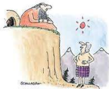
"You can come down now, Everett. The children have grown up and left."