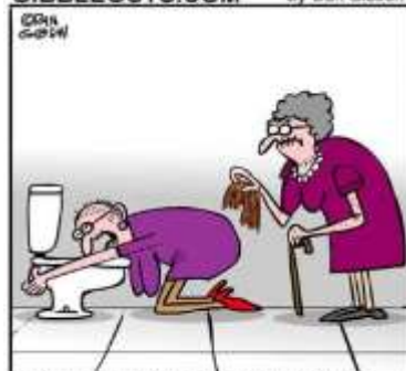
Your best friend is the one that will hold your hair out of the way after a night of hard partying.