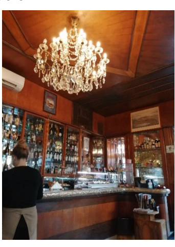
Antico Café Torinese