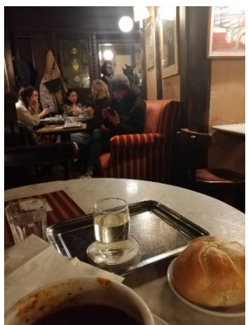
Goulash and white wine.