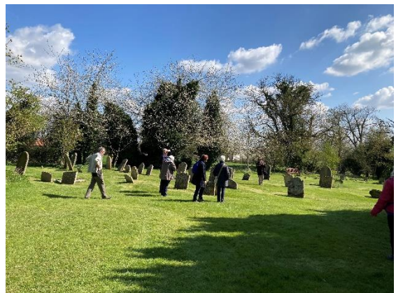
Walkers at Caxton churchyard

There will sometimes be a break for refreshment at about half-way. It is sensible to carry a drink at least, in keeping with the weather.