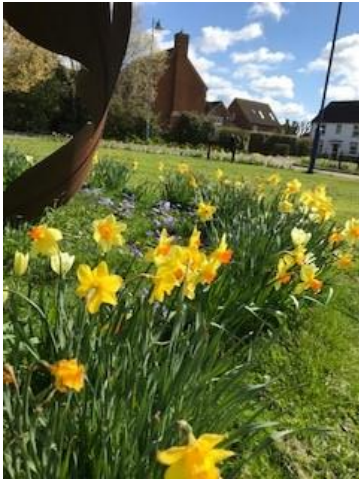
Spring at last in Great Cambourne