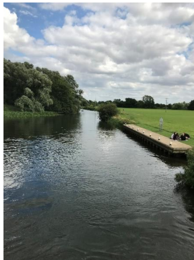
River Great Ouse at Houghton

Our website: https://u3asites.org.uk/cambourne