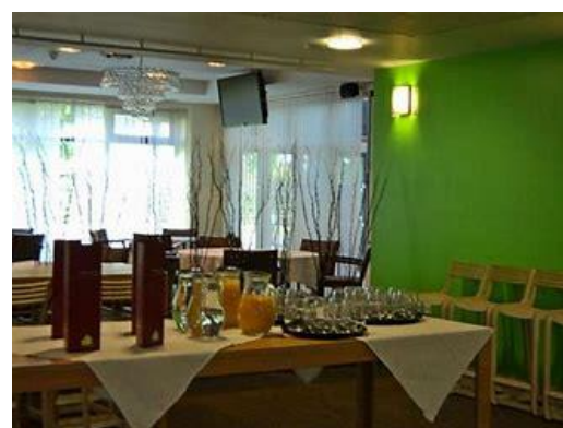
The Park Restaurant, Cambridge Regional College