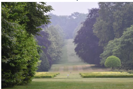
The Western Avenue, Wimpole