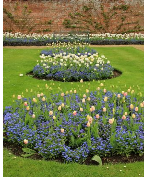
Audley End in spring