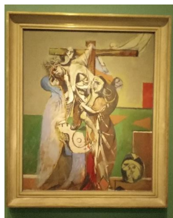
The Descent from the Cross - modernist style