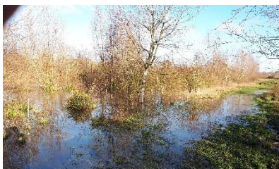
Floods at Redgrave Water 24 December by Dekla Termanis

Link to National Newsletter national website