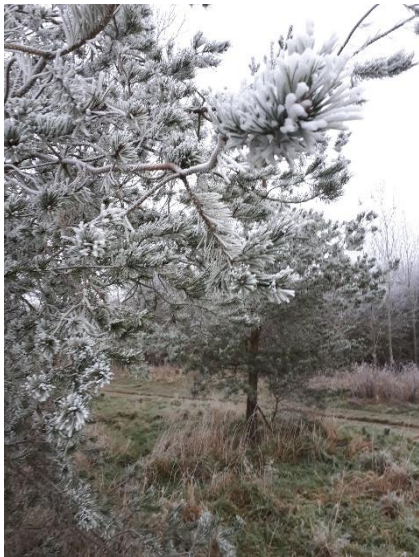
New Year's Day in the Country Park