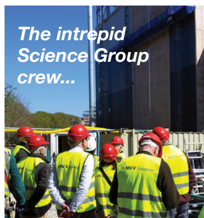
The intrepid Science Group crew...