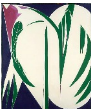
Rising Green by Lee Krasner