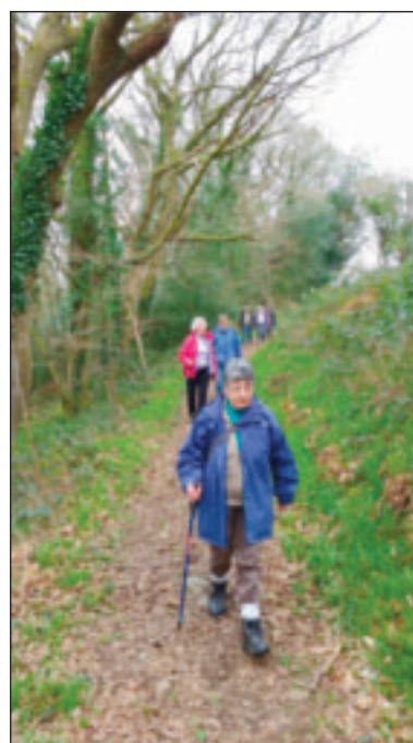
Walkers 2 in the Seaton Valley