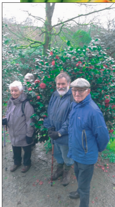
Llanhydrock walkers amongst camelias