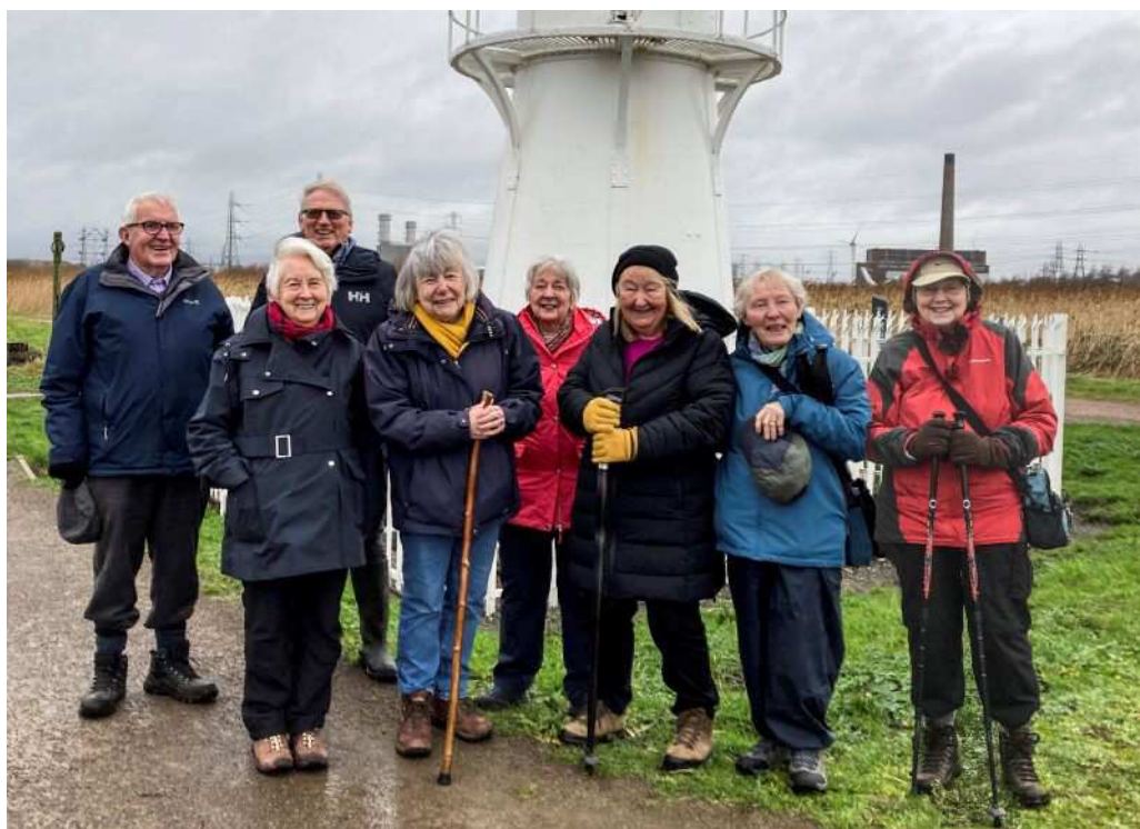
Stragglers walk at the Newport Wetlands