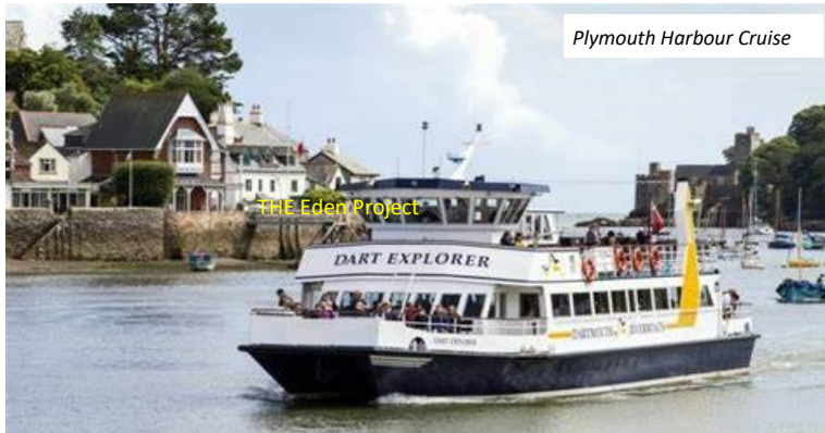
Plymouth Harbour Cruise