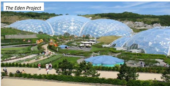
The Eden Project