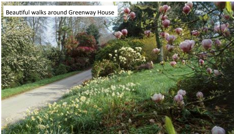
Beautiful walks around Greenway House