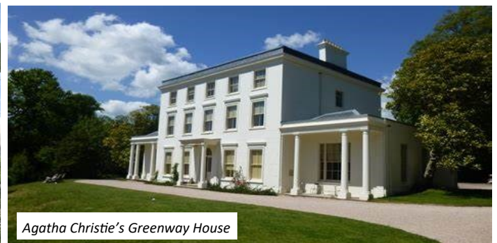
Agatha Christie's Greenway House