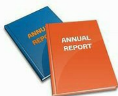
2018 Chairman's Report