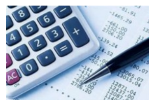
2018-19 Accounts and Treasurer's Report