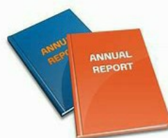
2019 Chairman's Report