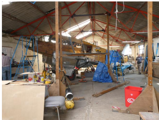
Workshop (Chris Embling)

The next Grumpies' outing will be a pub lunch, probably mid-September. Precise details will be circulated to Group members in due course but if you would like to be added to the circulation list, please let me know at grumpies@bhillu3a.org .