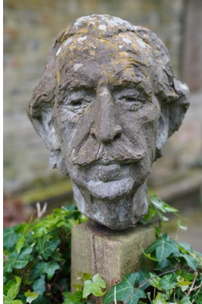
Sir Frederick Gibberd

Sir Frederick Ernest Gibberd RA was an English architect, town planner and landscape designer. He is particularly known for his work in Harlow, the London Central Mosque in Regents Park, the Liverpool Metropolitan Cathedral and Dicot Power Station.