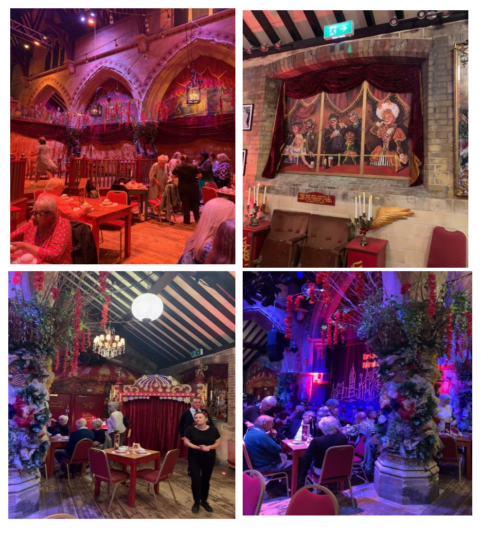
I think I can say a good time was had by all.

Sue took some photos of the day which are shown here: