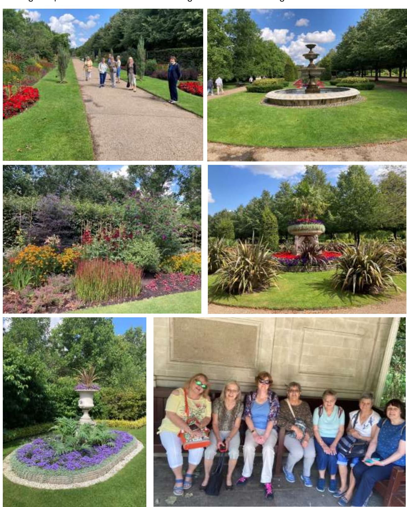
We found a shady place to rest and admire the flowers before moving on to the Queen's Rose Garden. En route, we found another site for Capel Manor College and admired the scarecrow on their allotment.

Our July visit was to the beautiful Broadwalk and Queen's Rose Gardens in Regents Park. We wandered along admiring the long borders of the Broadwalk planted with a range of beautiful bedding and perennial flowers. There were signs here and there of gardeners at work.