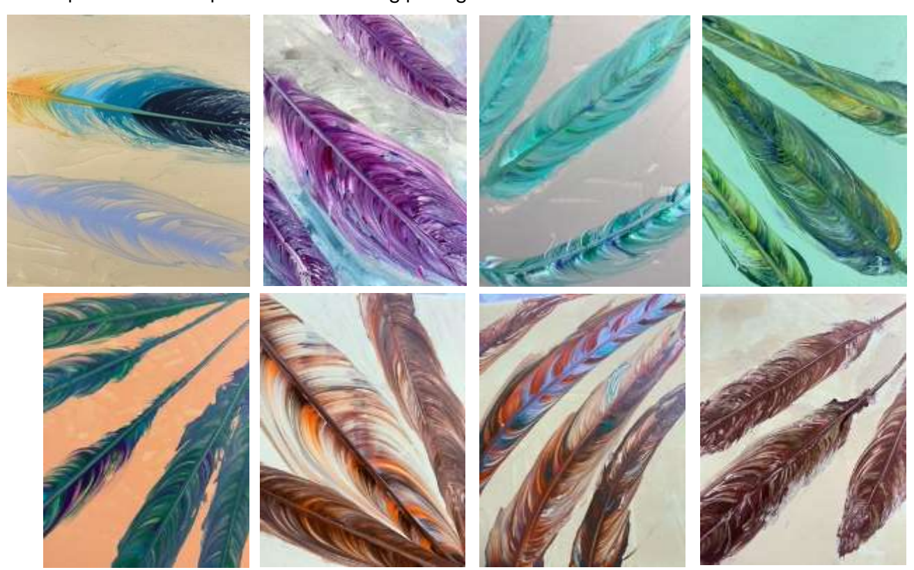
This was voted the hardest technique yet. Even so they all managed to produce great paintings.