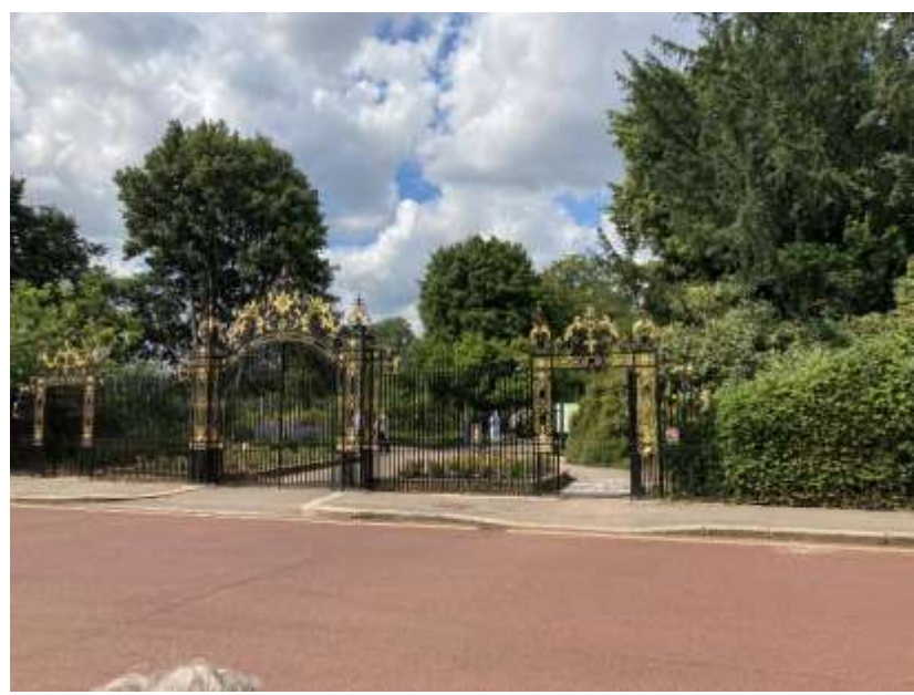
The Queen's Rose Gardens are situated beyond some very ornate gates which we admired.