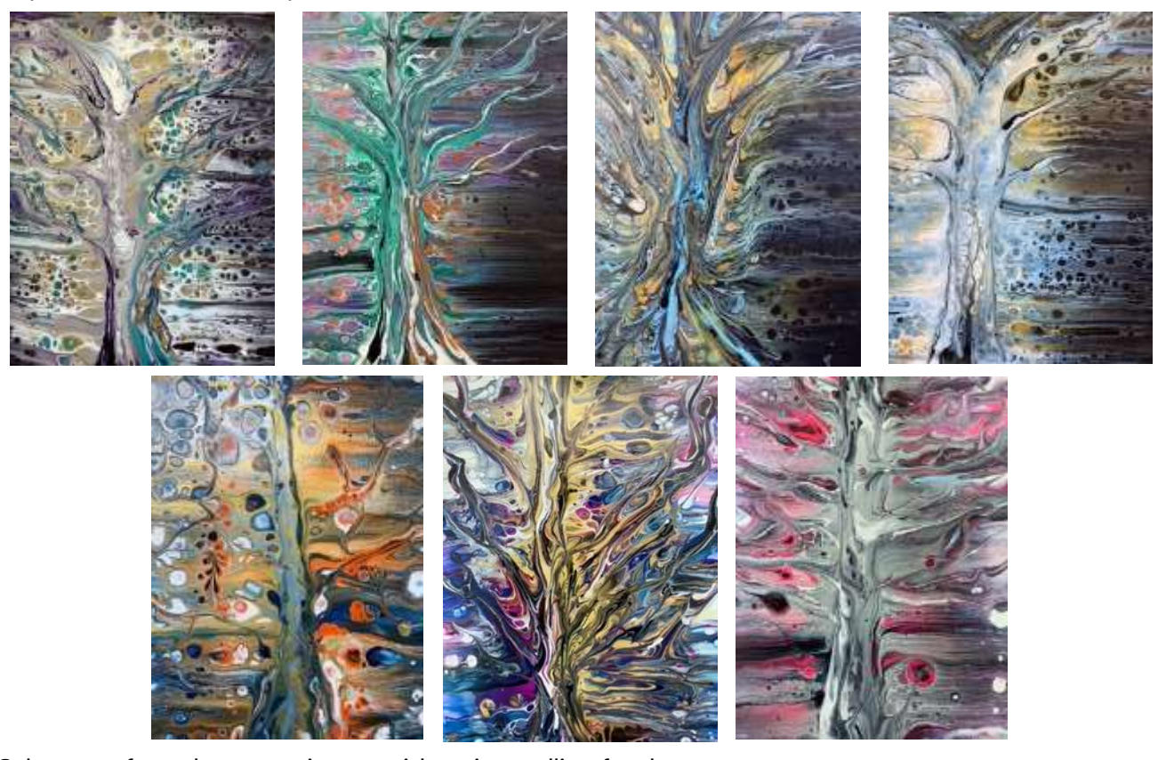
Others preferred to experiment with string pulling feathers.

Some of the groups had another go at 'trees', using sheets of kitchen roll to 'swipe' a silicone impregnated paint over lines of paint and then fashioning a tree shape with either palette knives, lolly sticks or narrow strips of kitchen towel.