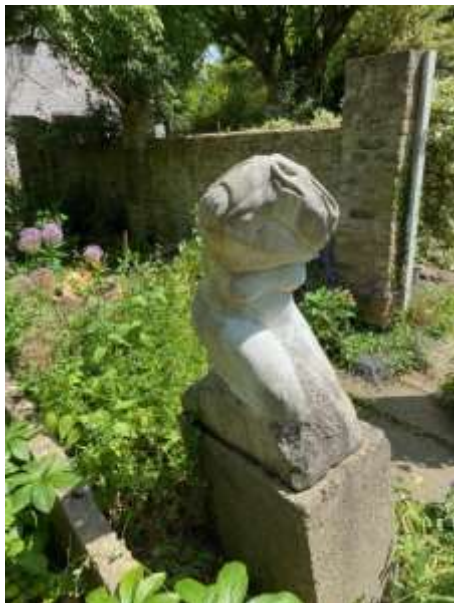
Pregnant Girl kneeling

We were intrigued by the collection of sculptures and architectural pieces, 90 in total. One of the group, admiring the sculpture called 'Pregnant Girl kneeling', thought it was a walrus. I suppose it all depends on the angle you are looking at it.