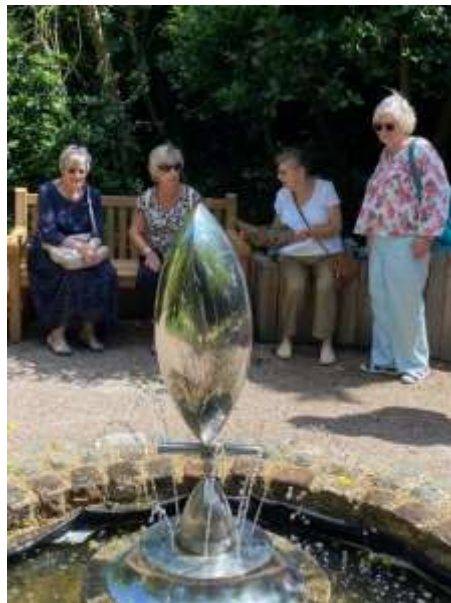
Group Members relaxing