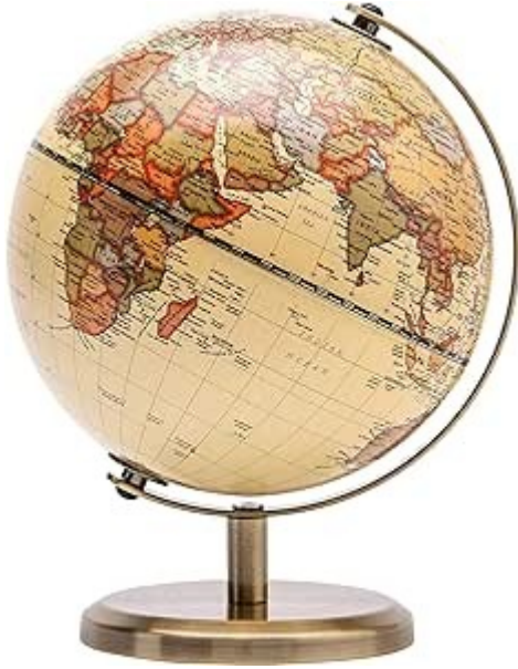
A gneiss rock!"