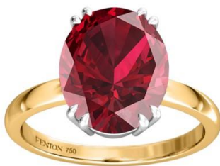
A RUBY SOLITAIRE RING

We all enjoyed playing with patterns to help us to understand the internal arrangements of atoms in crystals. These are reflected in the shapes we see and properties such as cleavage as well as the way crystals interact with light.