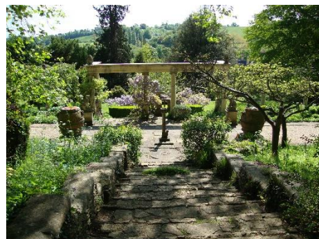
The Peto Garden, Wiltshire (above)