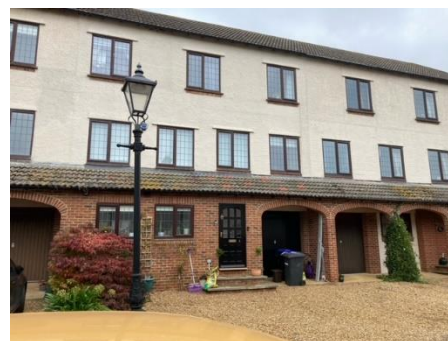
The Old Creaton Hospital, now mews houses.