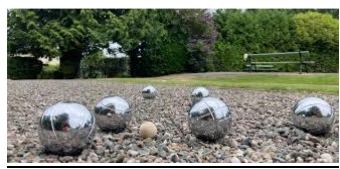
November action photos from Terry!!