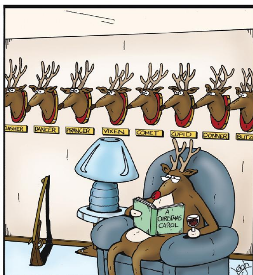
All of the other reindeer used to laugh and call him names.

I made myself a snowball, As perfect as could be, I thought I'd keep it as a pet, And let it sleep with me. I made it some pajamas, And a pillow for its head, Then last night it ran away But first-- it wet the bed.