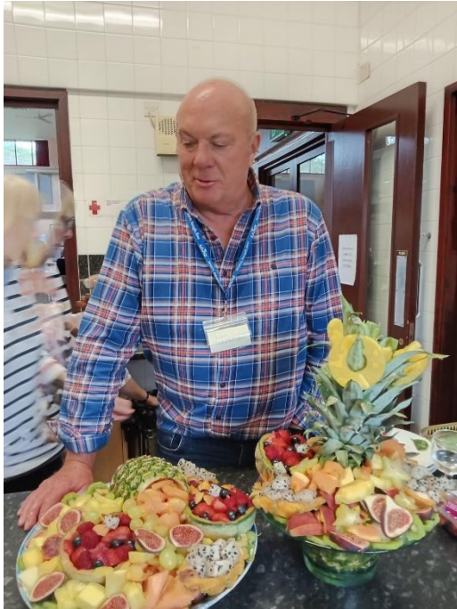
Allen's fruit salad sculptures