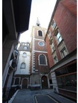
St Mary Abchurch