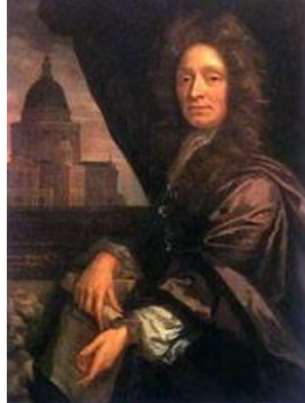
Wren, portrait c 1690