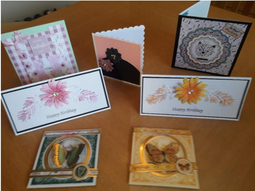
A selection from our card making group