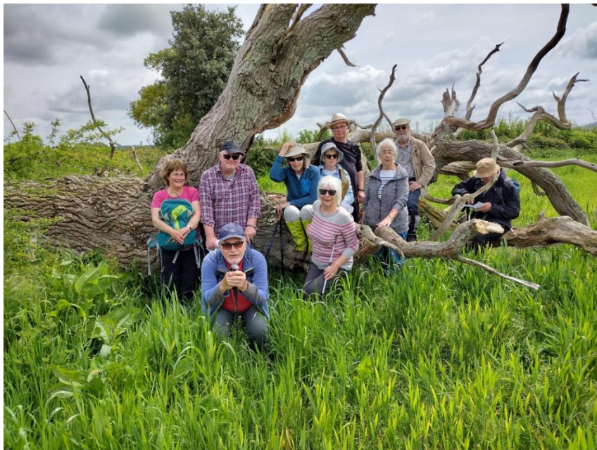
May walking group - a field near Chetnole

By contrast the May walk, around Chetnole, had probably the smallest total ascent of any of our walks. Very muddy sections encountered on the recce had substantially dried out by the time of the walk, and cattle had been moved from some of the fields. Lunch was taken at the welcoming Chetnole Inn.