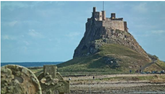
View of castle

----- Lindisfarne was the destination next day. We had to have an early start to enable us to beat the tides. The Holy Island of Lindisfarne is a tidal island off the northeast coast of England. It is also known as Holy Island. It constitutes a civil parish in Northumberland. Lindisfarne has a recorded history from the 6th century. It was an important centre of Celtic Christianity. In addition to the castle, the ruined priory and the copy of the Lindisfarne Gospels attracts many visitors