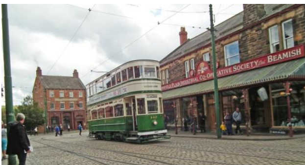
Old tram in main street

Beamish Open Air Museum was our destination next day. We were transported back to an earlier era; with houses, shops and transport of the times. There was the chance to go down a coal mine, visit an early farm and enter shops displaying goods that were used before WW2 showing prices at the time.