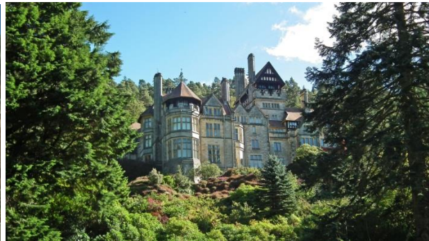
View from the Gardens

Beamish Open Air Museum was our destination next day. We were transported back to an earlier era; with houses, shops and transport of the times. There was the chance to go down a coal mine, visit an early farm and enter shops displaying goods that were used before WW2 showing prices at the time.