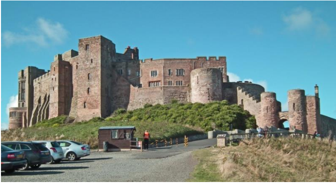
Entrance to Castle

After leaving Fountains Abbey we had a "Photo Stop" at Banburgh Castle. The Castle was restored by Lord Armstrong, from Craggside. It is one of the finest castles in the United Kingdom