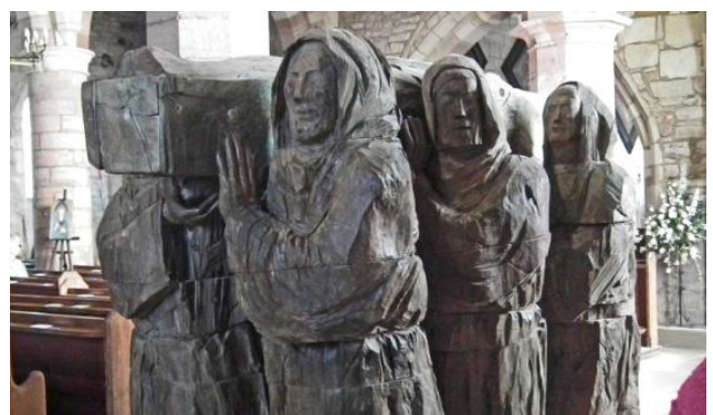
Wooden carving in church

----- Next morning we left to return home. On the return we stopped at Fountains Abbey, where we had lunch and toured the Abbey, a few energetic ones also managed to visit the Studly Royal water gardens: they said that they were worth the effort .