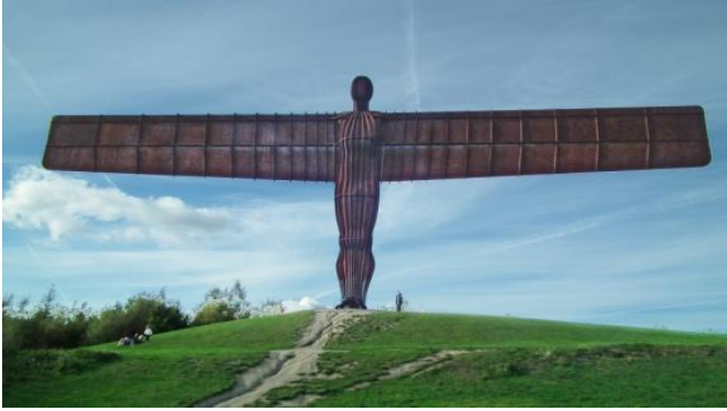
Angel of the North

On the way back we stopped at "The Angel of the North" by Antony Gormley. The structure stands 20 metres (65feet) high with a span of 54 metres (175feet) and weighs 208 tons - Body 108 tons and each "Wing" 50 tons. It cost £800,000.