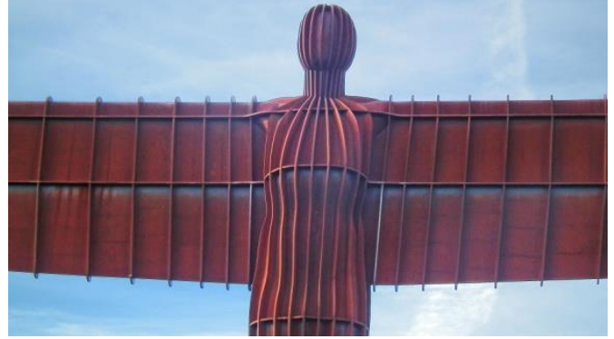
Close up of structure

----- Lindisfarne was the destination next day. We had to have an early start to enable us to beat the tides. The Holy Island of Lindisfarne is a tidal island off the northeast coast of England. It is also known as Holy Island. It constitutes a civil parish in Northumberland. Lindisfarne has a recorded history from the 6th century. It was an important centre of Celtic Christianity. In addition to the castle, the ruined priory and the copy of the Lindisfarne Gospels attracts many visitors