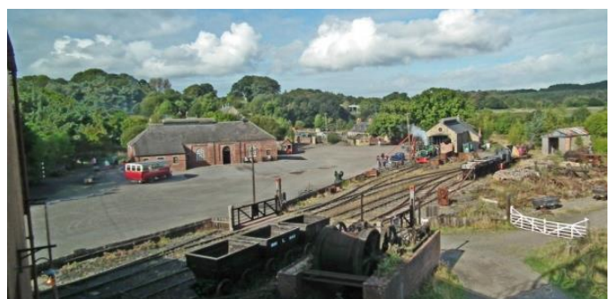
View of the colliery & mine