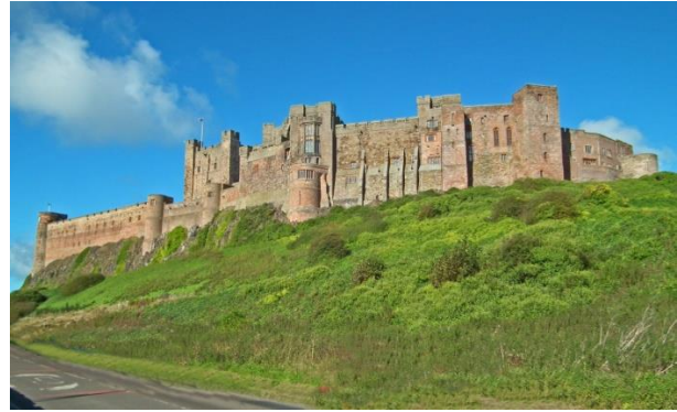
View from Car Park