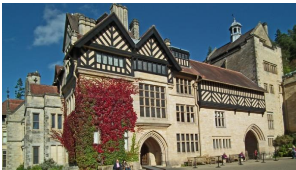
House from the side

The next morning we visited Cragside. This was the first house in the world to be lit using hydroelectric power. Built into a rocky hillside above a forest garden of just under 1,000 acres, it was the country home of armaments manufacturer, Lord Armstrong. We spent the day there, where we saw the original pumps, generators and equipment used. We also walked around the very attractive gardens.