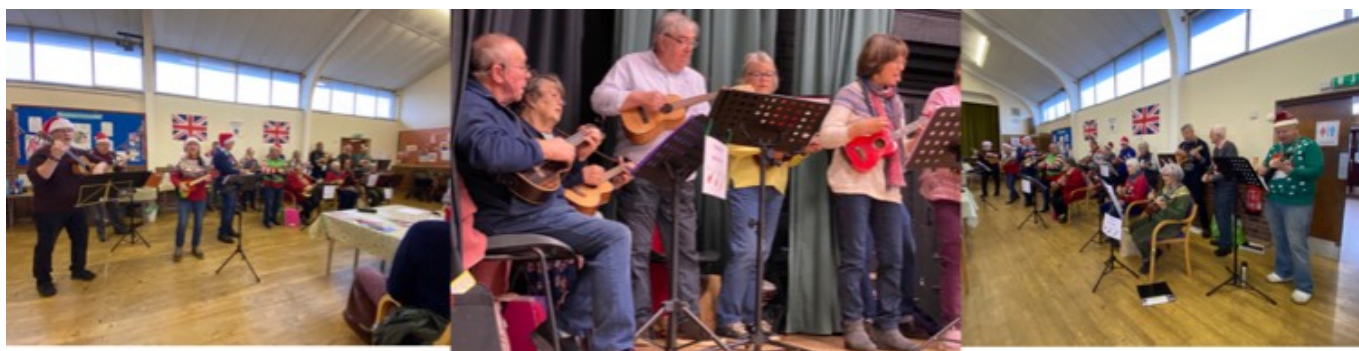
The Ukulele group