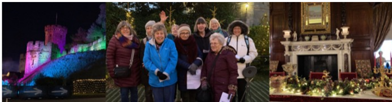
The Wider Horizons group at Warwick Castle