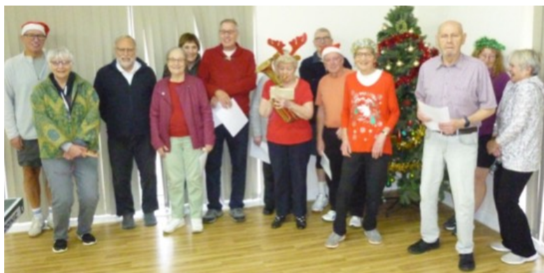
The Table Tennis group Christmas meeting - we don't usually dress like this to play!