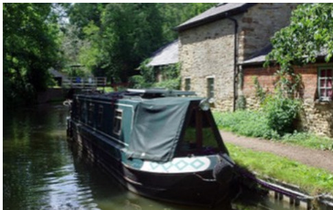
The Oxford Canal

In November the group walked around Bicester. We met at Bure Park shops and set off through Bure Park Nature Reserve. The route took us across to the Kingsmere Estate and then alongside Bicester Village to the station. There was a lot of surface water around so we had to be careful crossing the road. We returned to Bure Park via Garth Park.