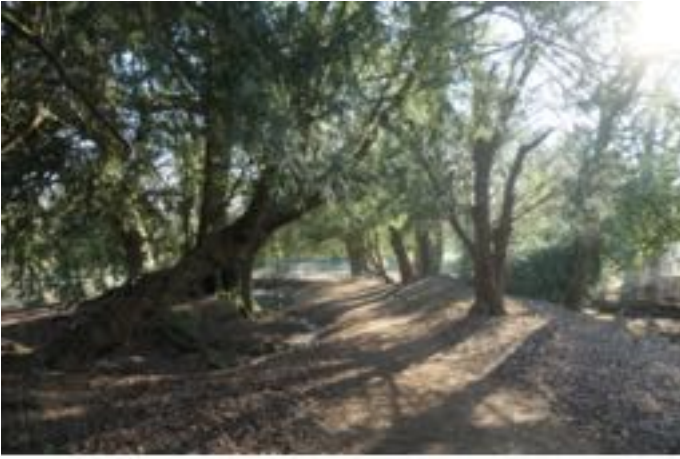
For our March visit we went to Cliveden