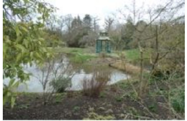
It was cold, but there of walking to keep you warm, particularly of you go down to the river