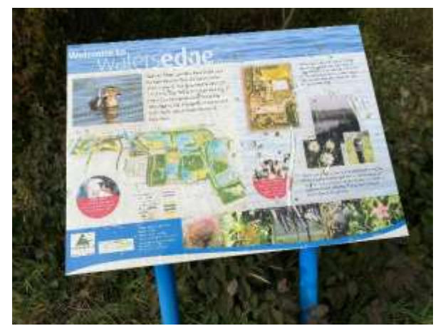
Hopeful birds by the Visitors' Centre, signage and view from the reserve.