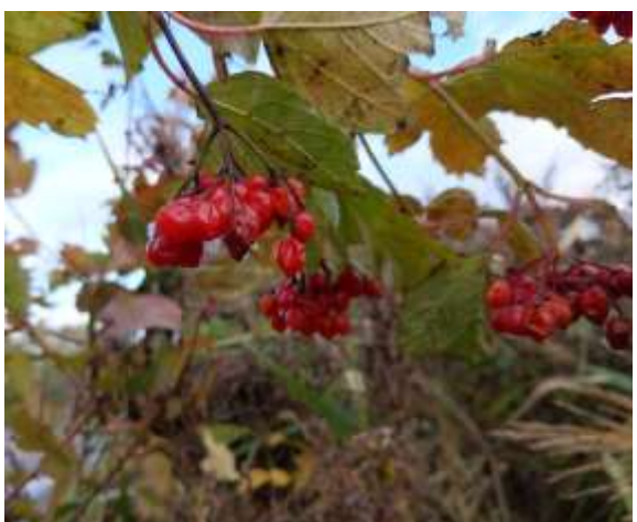
Clockwise: Viper's Bugloss Echium vulgare; Spindle Euonymus europeaus ; Guelder Rose Viburnum opulus

Below: Rat taking advantage of the bird feeders.