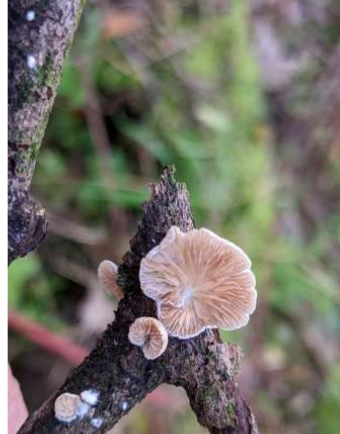
Clockwise: Brittle Cinder Kretzschmaria deusta; Honey fungus Armillaria sp.; Oysterling Crepidotus sp.; Glistening Inkcaps Coprinellus micaceus