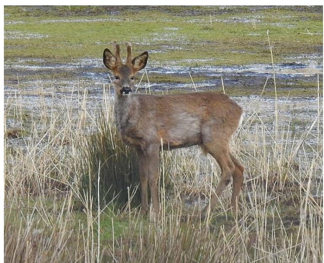
Above: Tonka wild ponies (ST), Roe Deer, Scarlet Elf Cup fungi (HK). Page 2: Marsh Harrier (ST), Willow catkins (KF), Traveller's Joy (MN)