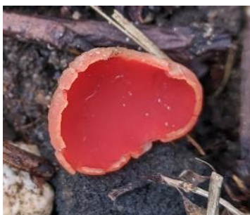
Scarlet Elf Cup fungus

Looking forward to the next one in April at Jillywood.