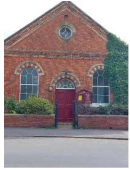
Tickton's two churches: St Paul's and the Methodist (once Wesleyan) Chapel