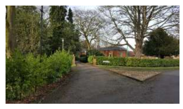
Black Swan, and today's entrance to Brandesburton Hall

I enjoyed the history of the 350-year-old Black Swan, one of two pubs still open in the village, which was the recording centre for the Royal swans on the nearby Leven Canal.