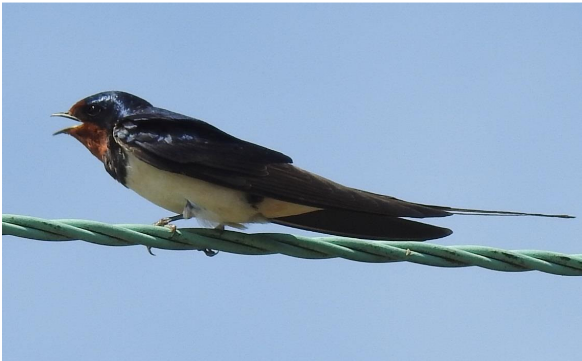
Above: Swallow on a wire

Back at the farm, we sat in the gorgeous insect-friendly garden, enjoying refreshments laid on by Sue, before examining the contents of Rob's moth trap, which he'd set up for us the night before.