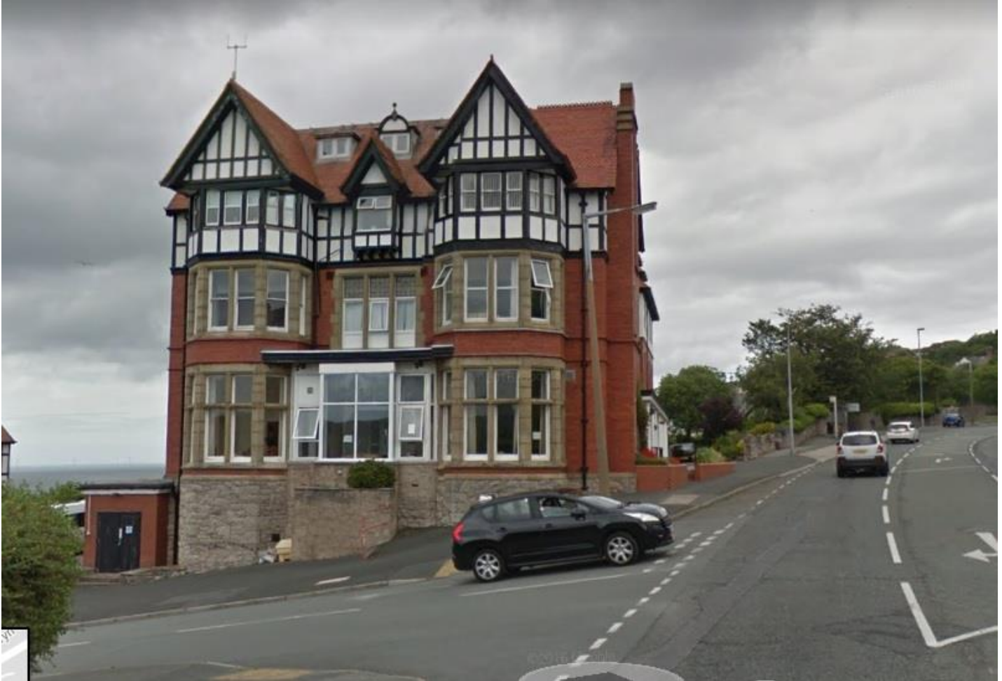
QUEENS COURT Sheltered Accommodation. Turn left here to enter Queens Road.

Return to the A55 by reversing the route to STOP THREE (on Local Map 2) back to Exit 22 – go right on the roundabout near the town centre at the bottom of the hill (next to Plumb Centre), Then left onto the A55 towards Llandudno.