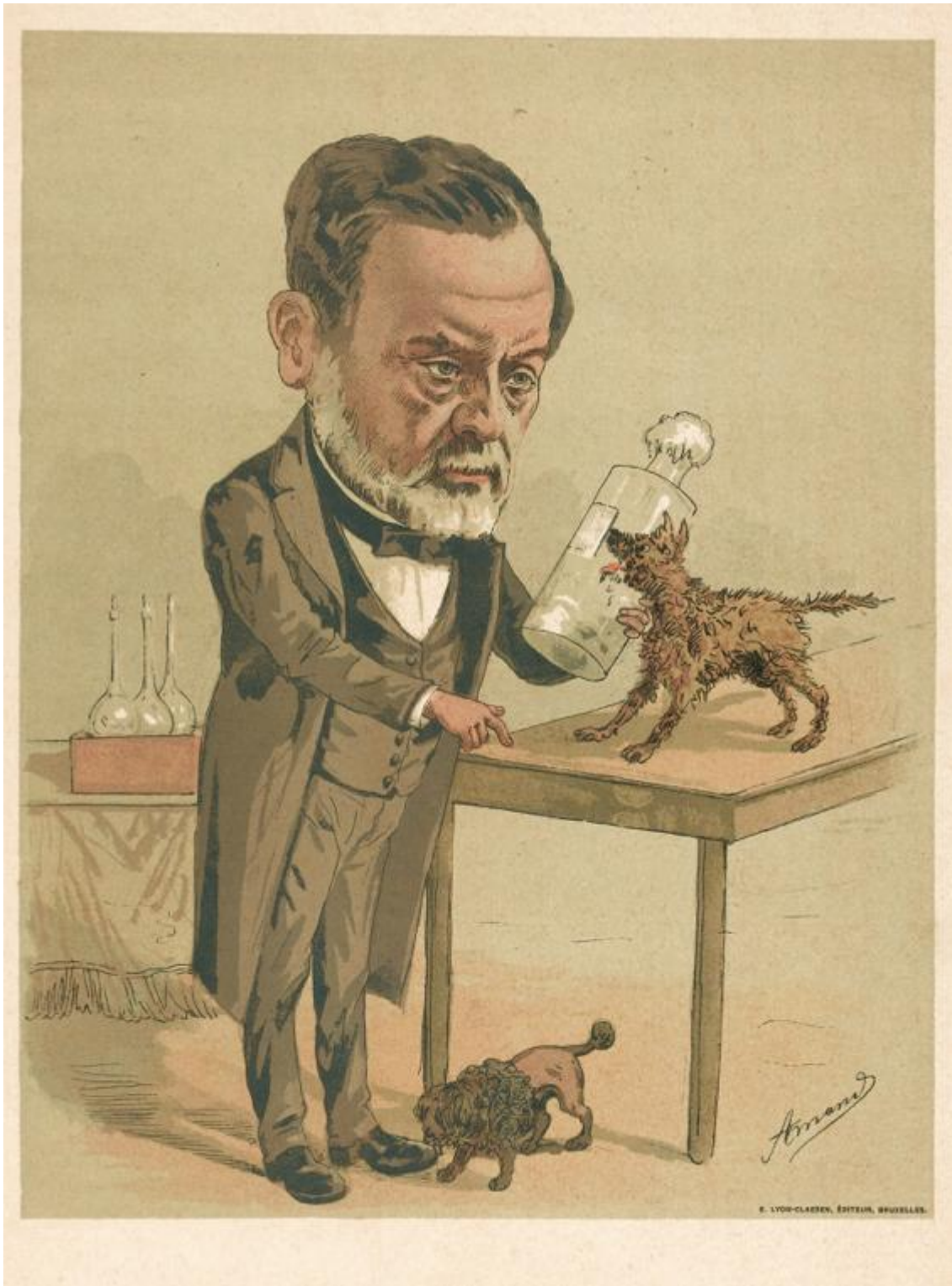
Louis Pasteur. Colour lithograph by Amand, 188-(?).. Credit: Wellcome Collection. Attribution 4.0 International (CC BY 4.0)