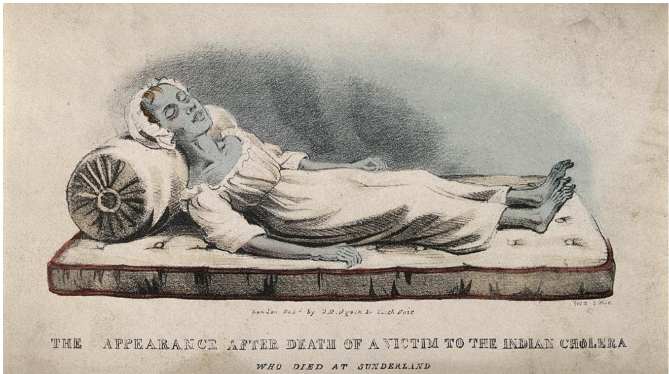
A dead victim of cholera at Sunderland in 1832. Coloured lithograph by IWG.. Credit: Wellcome Collection. Attribution 4.0 International (CC BY 4.0)