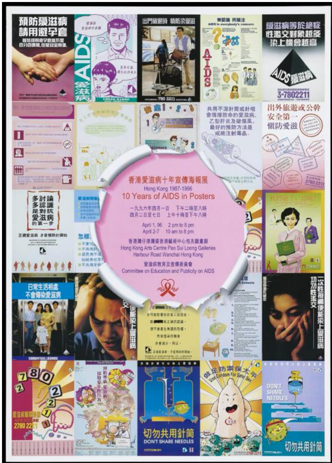
A range of AIDS posters torn in a circle to reveal a pink centre showing details of an exhibition of AIDS posters in Hong Kong. Colour lithograph, 1996.. Attribution-NonCommercial 4.0 International (CC BY-NC 4.0)