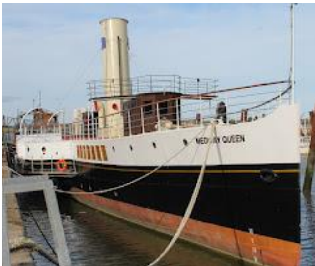
The Medway Queen

Tuesday 21st May at 2 to 4.30pm - Visit the Paddle Steamer Medway Queen at Gillingham & celebrate her 100th birthday with a cream tea in the newly renovated saloon.