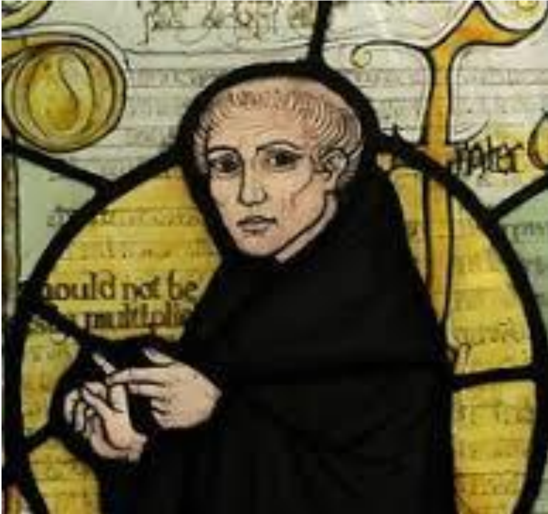
William of Ockham

9. Of the four fundamental forces, electromagnetism, gravity, the strong nuclear force and the weak nuclear force, which is the weakest?