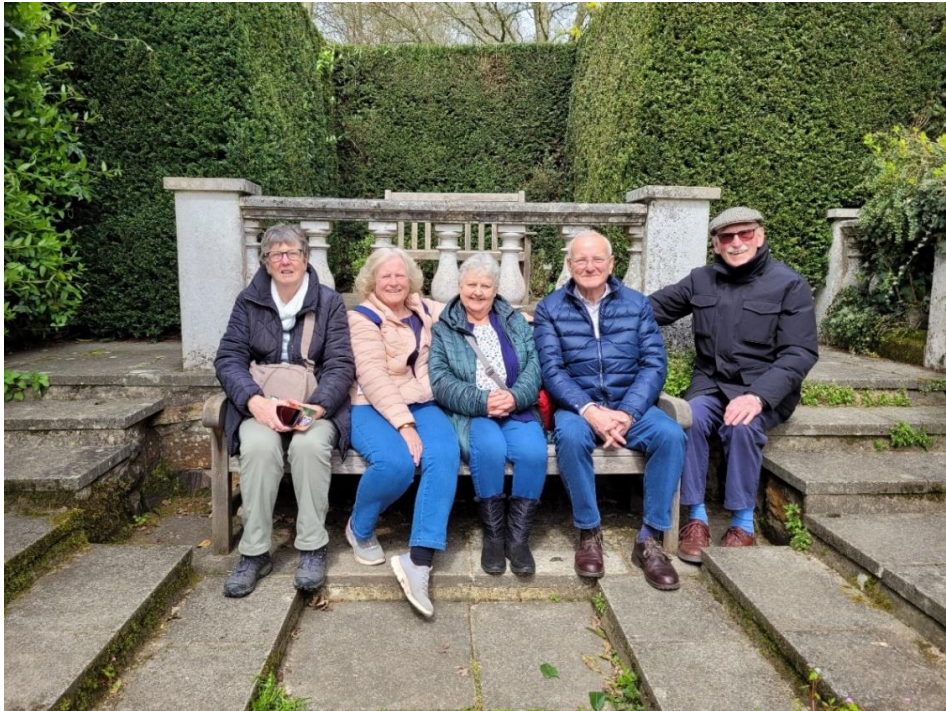
Local History group 2 had their first outing on 27 th April, to Great Comp Garden. Beautiful colours from the spring showers plus blue skies.