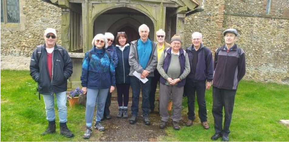
Rambling group photo outside Fairstead Church.