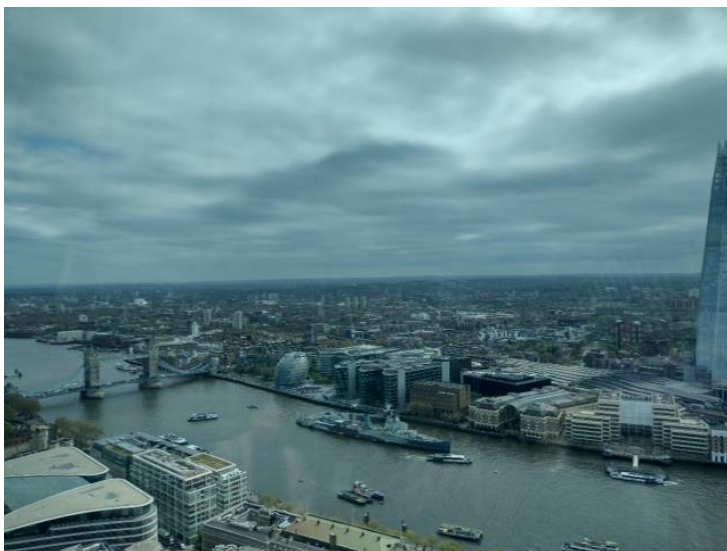
Views from the Sky Gardens