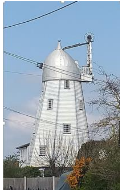
Terling Windmill, now converted to residential accommodation