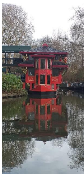
Floating Chinese Restaurant on Regents Canal

On December 21 st twelve of us met up at Baker Street Station for what turned out to be a very enjoyable day. We soon saw the queue for 221B Baker Street on our way into Regents Park. We did a circular route around the park observing 4 herons. Mark got extremely close to one which did eventually move, as some thought it was plastic. We then soon stopped for refreshments.