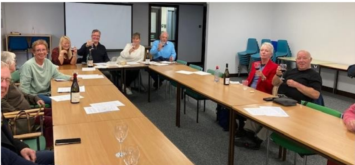
Enjoying a wine tasting session