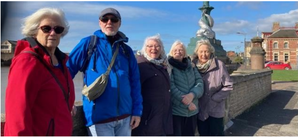
Strollers in Barnstaple, Rock Park and Torrington