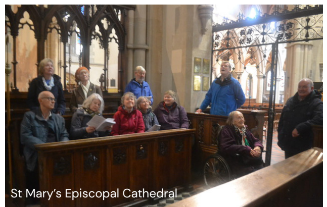
St Mary's Episcopal Cathedral

stone stair to the bell tower and, for some of us, actually ringing one of the bells – the only remaining peal of bells in Glasgow.