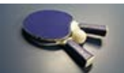
Table Tennis Group

So far no one has run out of things to say! We have started sharing links to French websites and news programmes, which offer opportunities to learn new vocabulary during this period of "distanciation sociale".