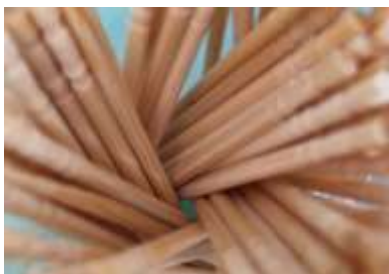
A – Cocktail sticks