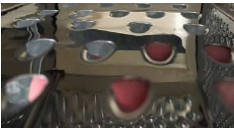
C (Kitchen Box Grater)