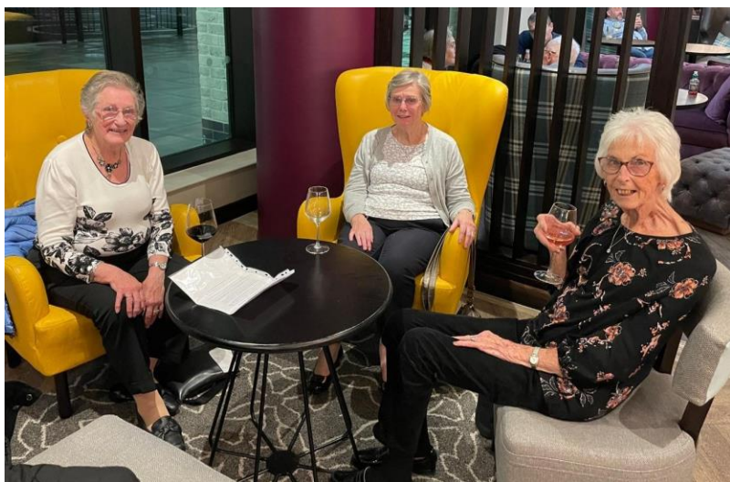
Relaxing after a hard day at the Eastenders face!