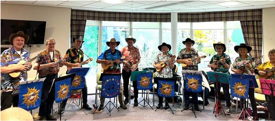
The Sunshine Strummers at the OK Corral