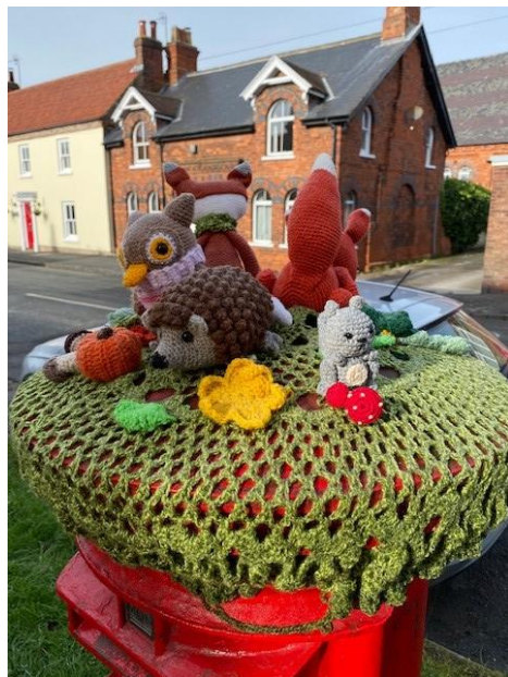
Spotted by the short walkers in South Cave