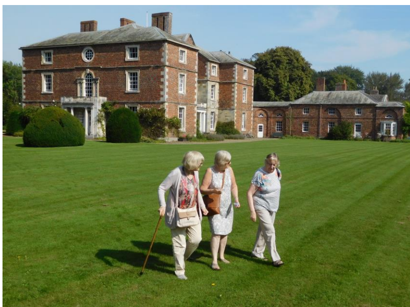
Stately Home visit to Boynton Hall