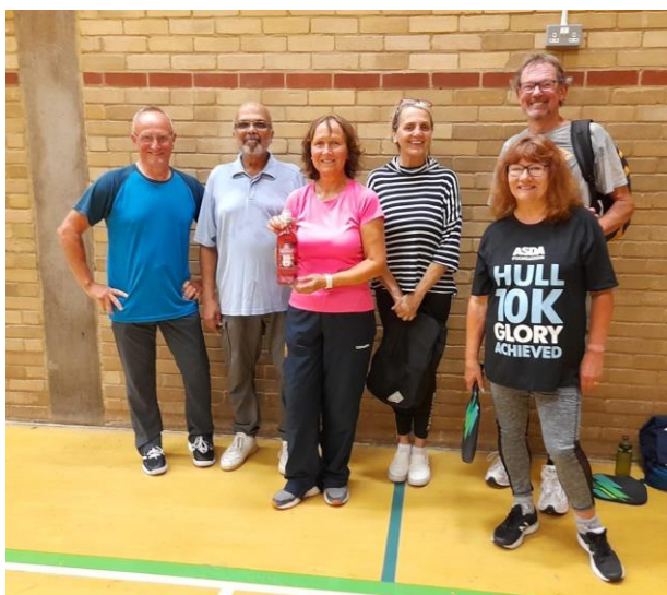
Our Pickle Ball Group

All welcome to a great afternoon to start Christmas with a bang. The proceeds to a great cause - The Stephen Hughes Foundation.