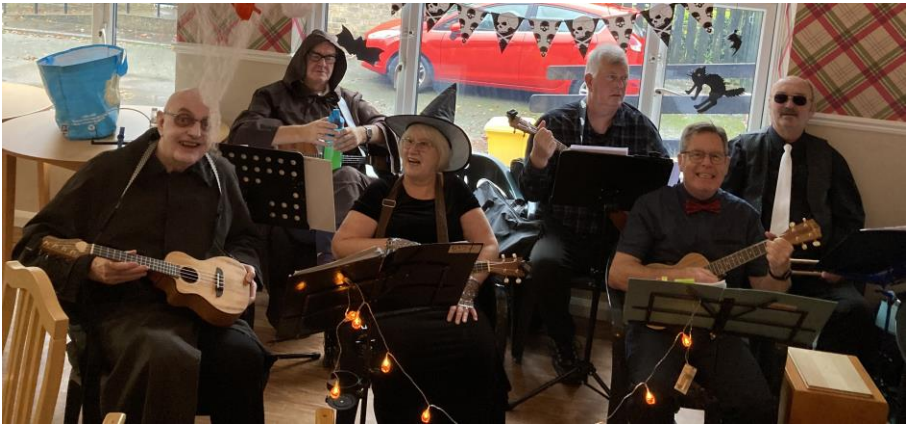
Barely Awake at the Hallgarth Halloween party